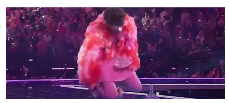
Swiss singer Nemo Mettler, with a broken throphy after their victory (Koha, 2024)